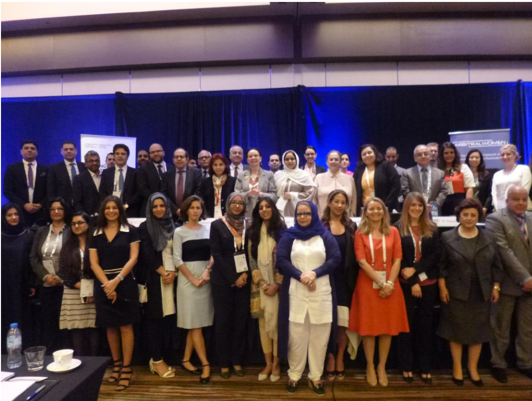
The conference participants.