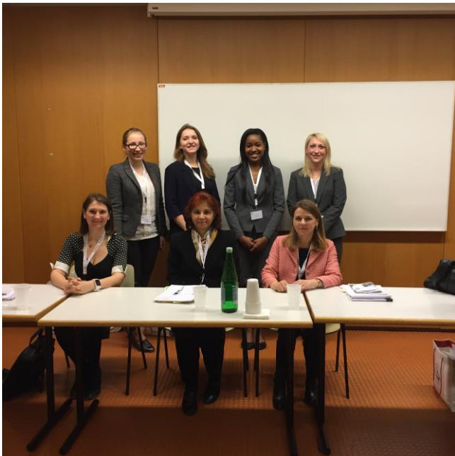
Teams and tribunal on 21 March in Vienna.