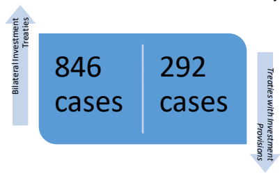
Cases under BIT versus cases under Treaties with Investment Provisions (based on UNCTAD Investment Policy Hub):

The most likely scenario is the one that is taken care of "That means that all participants will be required to adjust their expectations if the system is to flourish. The